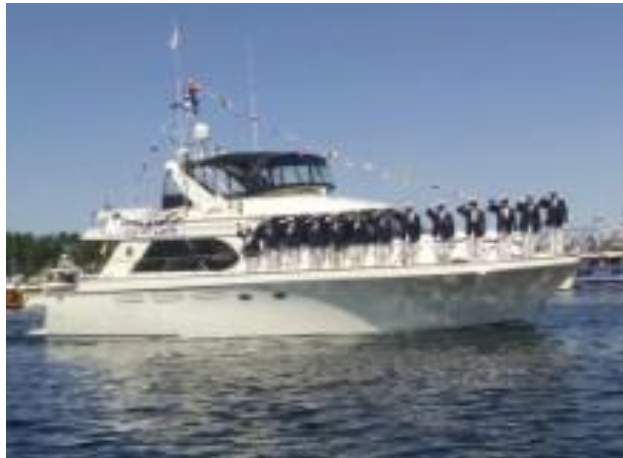
Opening Day May 3, 2015