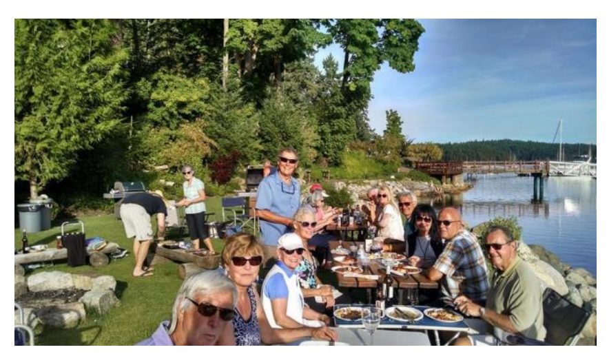
On the Move, Desolation Exploration. August 7-13, 2014

For those that did not make this cruise, your loss!